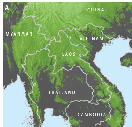
Swidden versus rubber. (A) Montane mainland Southeast Asia (green shaded areas) is defined here as the lands between 300 and 3000 m above sea level. (B) Most swidden fields and fallows on slopes near villages and roads in this area in Xishuangbanna have been converted to terraced rubber stands.

The conversion of both primary and secondary forests to rubber threatens biodiversity and may result in reduced total carbon biomass (3–5). Negative hydrological consequences are also of concern—for example, in the Xishuangbanna prefecture of Yunnan province, China—but current data are too sparse to quantify the extent of the impacts (3, 6). The effect of conversion to rubber on catchment or regional hydrology depends, in part, on the water use of rubber versus that of the original displaced vegetation. Another factor is the degree to which rainwater infiltration